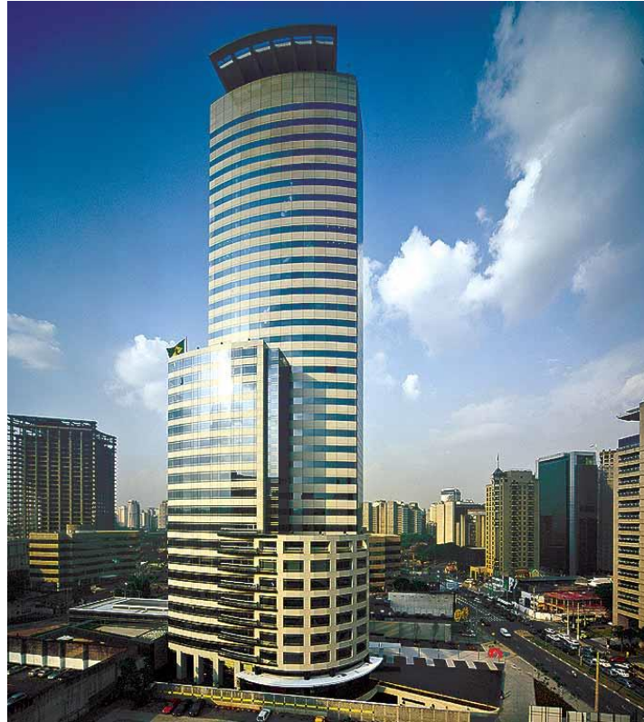
Figure 2. Architectural Prospecting of e-Tower, in São Paulo, Brazil ( Concrete International , 2003)

through the ground floor and 4 more floors with a concrete f_{ck} = 80\text{MPa} 7 at 28 days of age. In Fig. 2 is possible to see the architectural building prospecting of the e-Tower (Concrete International, 2003).