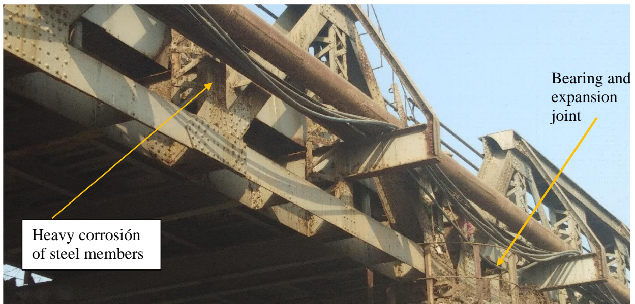
Figure 2. Photo of bridge showing bearing and expansion joint location

Special types of cameras and certified divers will be needed as water due to turbid due to pollution. It will involve underwater videography and taking photographs and Submission survey details in soft copies and status report of underwater survey. Total number of piers to be survey will be 9 piers of bridge.