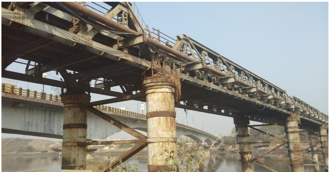
Figure 3. Photo of bridge showing warren truss type structure.

Figure 3 is a photo of the bridge showing the warren truss type structure. The work of repairing built-up steel girders by restoring or replacing damaged or deteriorated elements include, but is not limited to, providing temporary supports for jacking; modifying girders to accept jacking loads; temporarily supporting or reducing loads carried by girders; disconnecting or removing elements from girders by removing bolts or rivets; drilling and reaming holes; grinding to provide required finish or tolerances on steel surfaces; making minor repairs to decks within the work area; erecting repaired or replaced elements and incidental items by welding or high tensile strength bolting; and preparing surfaces damaged or left bare by the work and applying a prime coat of paint.