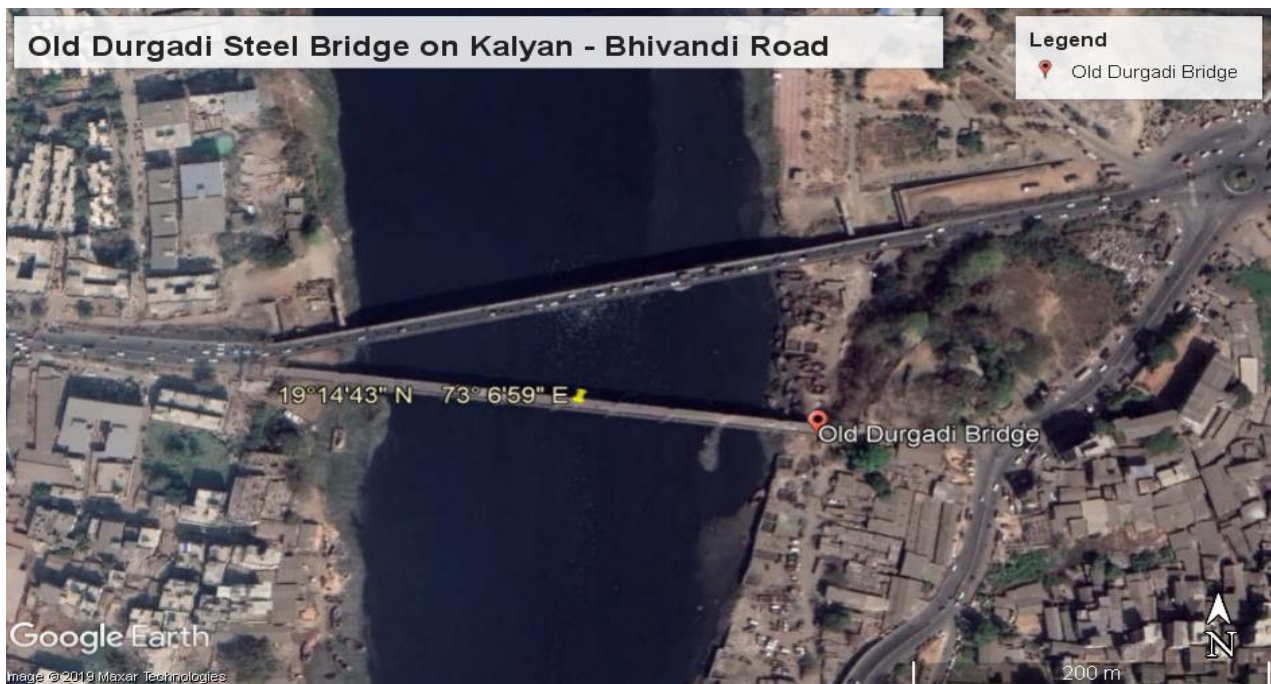
Figure 1. Google map of bridge.

Because of heavy pollution in Ulhas river, water and the humidity due to nearness to seashore, the bridge condition is very dilapidated. There is heavy corrosion of steel parts used in the structure. The structure must have been designed for normal river water in 1914. It is however seen that the color of river water is blackish which may be due to mixing of wastewater of surrounding urban areas and industrial waste. River water contains both organic and inorganic chemicals in addition to various gases like H 2 S, CO 2 , CH 4 , and NH 3 etc., that are formed due to the decomposition of sewage. This leads to faster deterioration of steel structure and concrete.